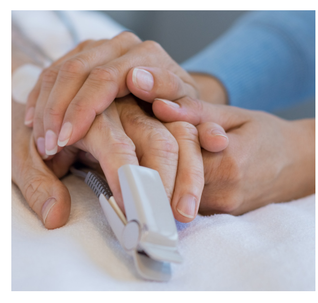
TALK TO US, SHARE YOUR OBSERVATIONS WITH US. THE ACUTE CONFUSIONAL STATE IS REVERSIBLE AND TRANSIENT. REPERCUSSIONS ARE RARE.